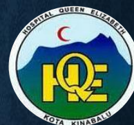
Hospital Queen Elizabeth